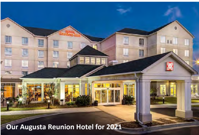
Our Augusta Reunion Hotel for 2021