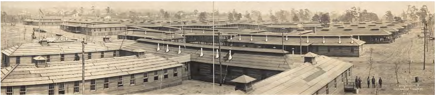
Early 1900s at Camp Hancock in Augusta, Georgia. Our 2021 reunion city has a rich military history.